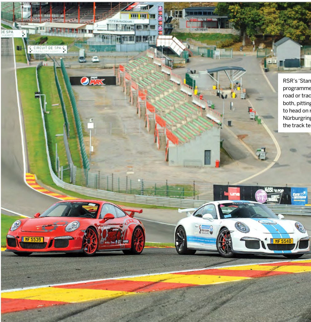
RSR's 'Standard Vs Modified' programme is available as a road or track test. We tried both, pitting 991 GT3s head to head on roads around the Nürburgring (bottom) before the track test at Spa (main)